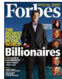
Aren't you getting ahead? Loudoun is the place to do it, says Forbes .