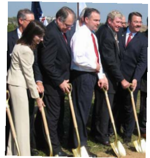
Governor Kaine, whose last official Loudoun visit in 2007 was for the One Loudoun groundbreaking, above, returns for a Town Hall meeting on March 31.