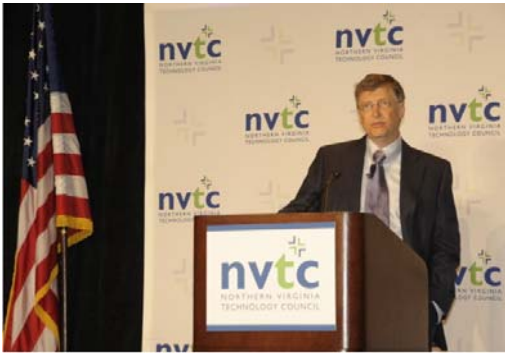
Bill Gates spoke to more than 1,100 at NVTC.